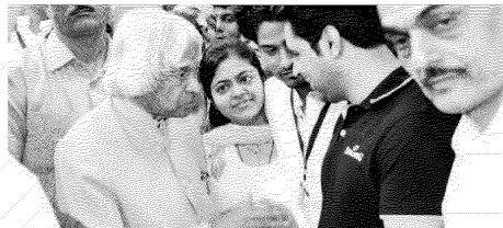
Kalam at IIT-B campus on Monday

Things took a turn for the worse when a security guard ordered them to disperse, resulting in the students shouting slogans. As this face-off was going on, a Mumbai Police officer landed up and reportedly threatened the students with arrests if they didn't disperse at once. A police van reportedly drew up and lathi-wielding